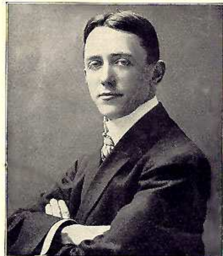
GEO. M. COHAN

Geo. M. Cohan, the Foremost American Comedian, signs an Exclusive Agreement with the Victor