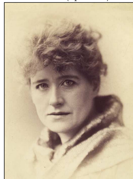
Dame ELLEN TERRY